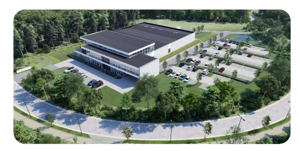
New LASEA building in Belgium (4000 m<sup>2</sup>)

With this merger, LASEA reinforces its position in the luxury goods sector with ceramic machining (MachCeram® patent) and pursues its diversification undertaken several years ago in new sectors.