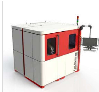
LS4 connected to LS-Robot